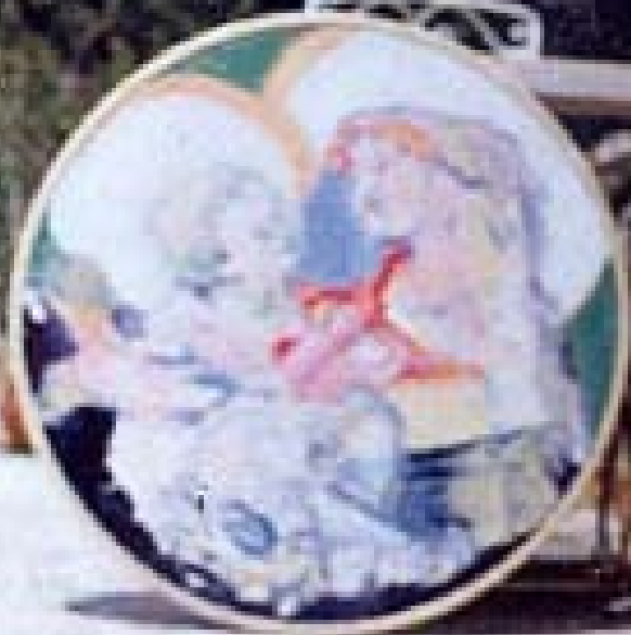
Embroidery titled "The Birth of the Christ Child" by a woman from the village of...